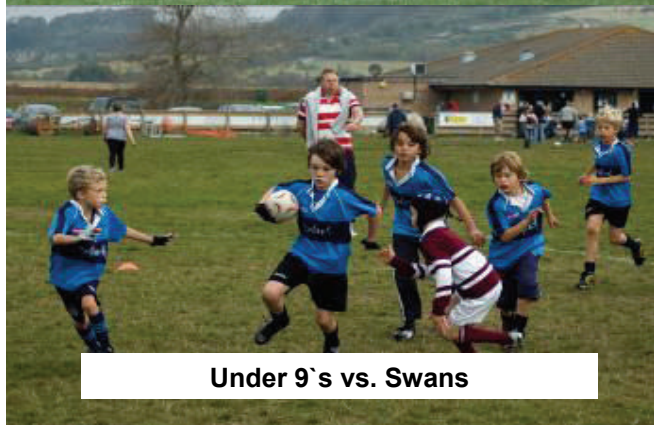
Under 9's vs. Swans