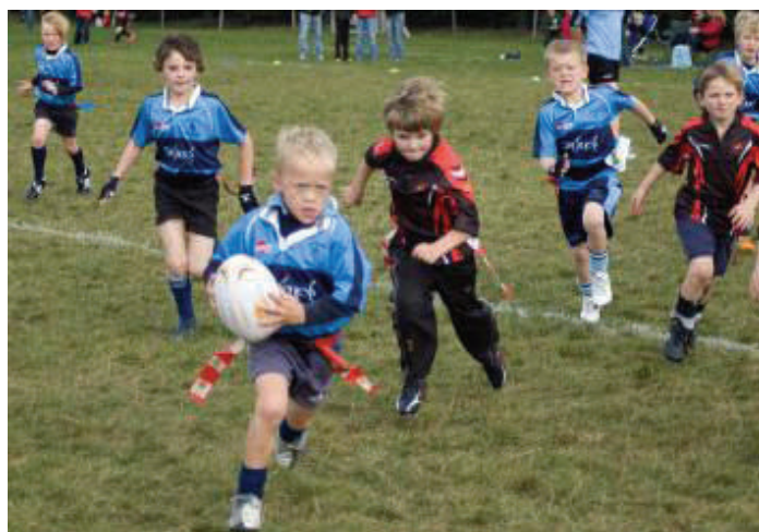
Under 7's & 8's vs. Sherborne