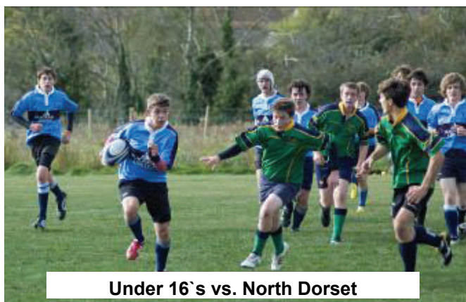
Under 16's vs. North Dorset

kids did get to keep their souvenir T-shirts though, with the RWC 2015 logo, although that probably didn't really make up for not seeing themselves on the television. The short video is currently available to view by following this link: http://buto.tv/nR65j