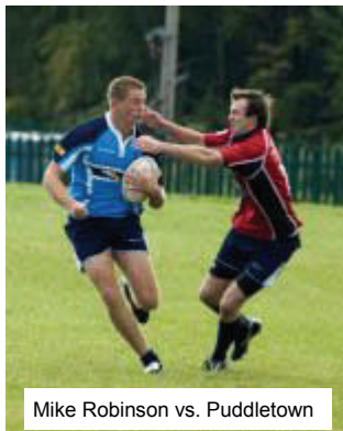
Mike Robinson vs. Puddletown

(see The Clean Neighbourhoods and Environment Act 2005 )